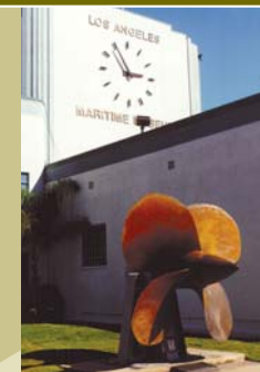
Los Angeles Maritime Museum

LADOT City of Los Angeles Department of Transportation