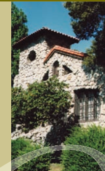
Bolton Hall Museum