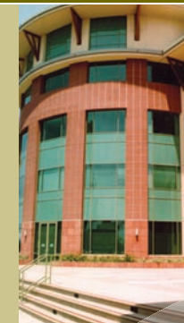
Marvin Braude San Fernando Valley Constituent Service Center

Van Nuys North Hollywood Burbank Downtown Los Angeles