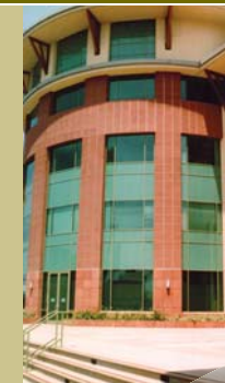
Marvin Braude San Fernando Valley Constituent Service Center