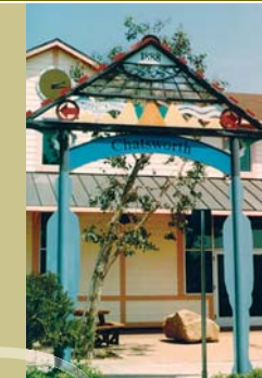
Chatsworth Metrolink Station/Park & Ride

Chatsworth Northridge Granada Hills Mission Hills Downtown Los Angeles Exposition Park/USC