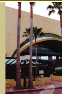
Patsaouras Transit Plaza