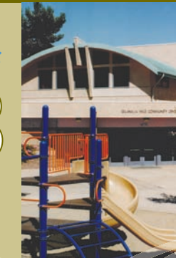
Granada Hills Community Center