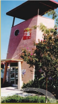
Sylmar/San Fernando Transit Center Child Care