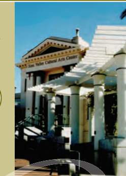
Simi Valley Cultural Arts Center