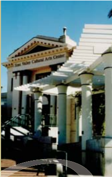
Simi Valley Cultural Arts Center